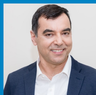
Amnon Shashua Mobileye (CEO) and OrCam (Co founder)

Prof. Amnon Shashua is a world-renowned expert in AI, computer vision, natural language processing, and other related fields. He is a 2020 Dan David Prize laureate in the field of Artificial intelligence and has founded and actively leads four companies using applied AI in various fields from automotive to assisted wearables to fintech: Mobileye, OrCam, AI21 Labs, Mentee Robotics, and "One Zero," the first digital bank in Israel. Prof. Shashua serves as President & CEO of Mobileye and ever since its acquisition by Intel – the largest in Israeli history – he is a Senior Vice President at Intel Corporation. Prof. Shashua holds the Sachs Chair in Computer Science at the Hebrew University of Jerusalem, has published over 160 papers in the field of machine learning and computational vision, and holds over 94 patents.