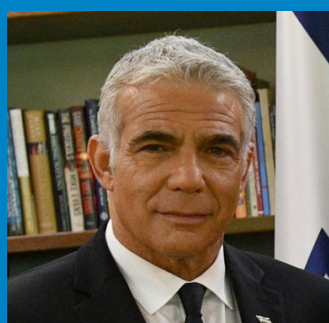
Yair Lapid Alternate Prime Minister of Israel

Yair Lapid is an Israeli politician and former journalist serving as the Alternate Prime Minister of Israel and Minister of Foreign Affairs since 2021. Lapid also serves as the chairman of the Yesh Atid, having previously served as Leader of the Opposition from 2020 to 2021 and as Minister of Finance from 2013 to 2014.